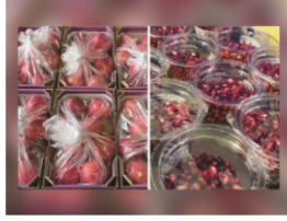
Sustainable Packaging From StePac aims to Extend the Pomegranate Season