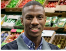
John Vena Inc. Hires New Controller