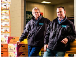
John Vena Inc. Celebrates 100 Years of Evolution, Growth and Innovation